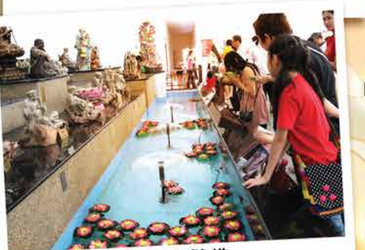
蓮花獻佛 Offering of lotus flower to the Buddha