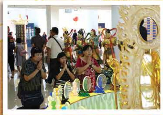
向五百羅漢拜年 Pay a New Year call to 500 Arhats

萬佛牆城 - 藥師消災殿 Great wall of Buddha - Shrine of the Medicine Buddha