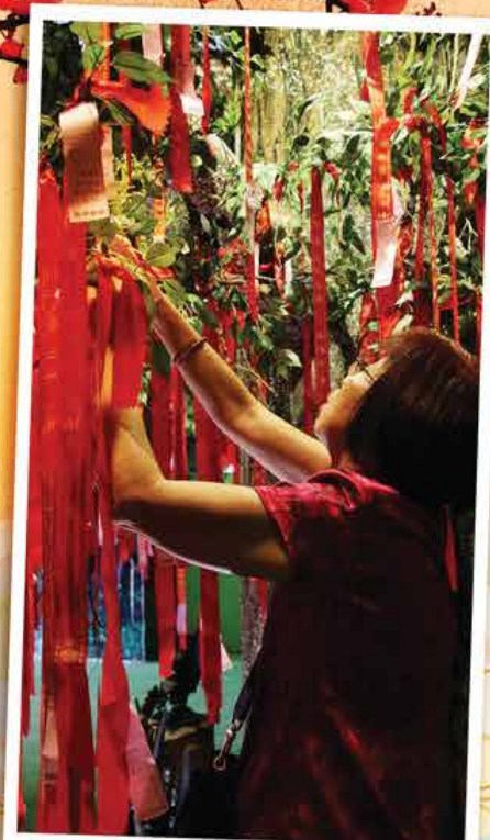
新春許願樹 New Year wishing tree