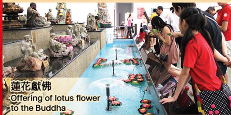
蓮花獻佛 Offering of lotus flower to the Buddha

Great wall of Buddha - Shrine of the Medicine Buddha