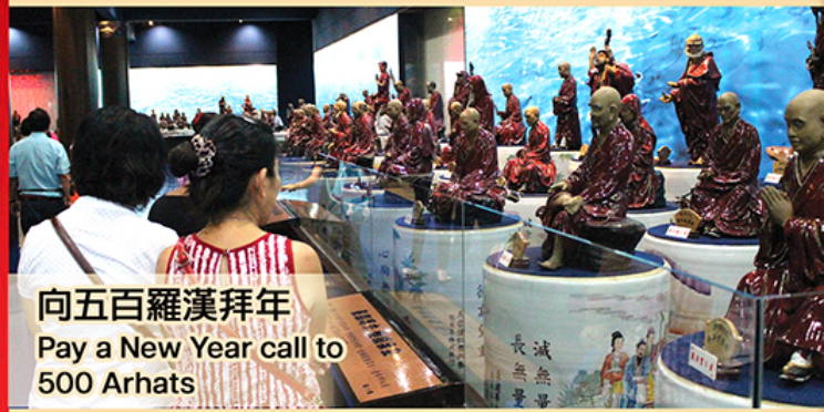
向五百羅漢拜年 Pay a New Year call to 500 Arhats